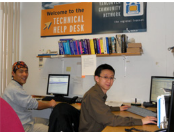
Vancouver Community Network Volunteers at the technical help desk.

VCN is a non-profit Internet service that offers free public access to the Internet and support to community groups and non-profit organizations. Learn more at www.vcn.bc.ca